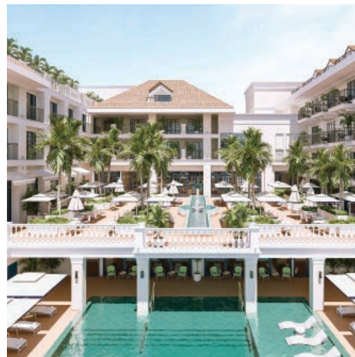
Sofitel Casco Viejo