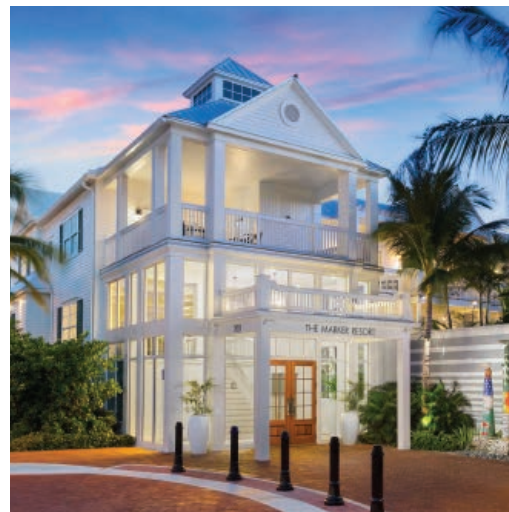
The Marker Resort