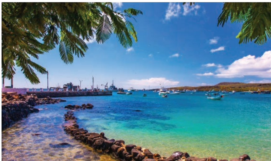
San Cristobal Island, Galapagos Islands, Ecuador