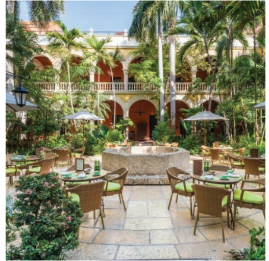
Sofitel Santa Clara