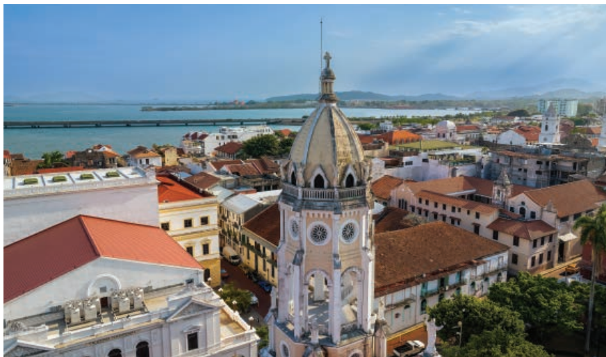
Casco Viejo, Panama City