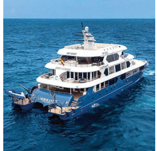
Cormorant II Luxury Yacht