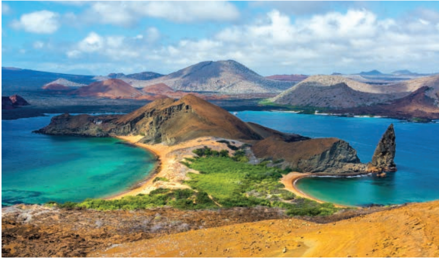
Bartolome Island, Galapagos Islands, Ecuador