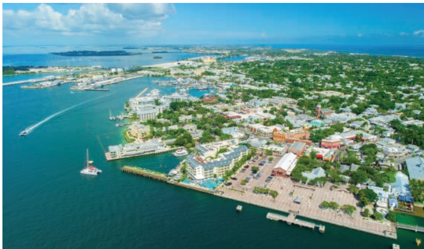
Key West, Florida, USA