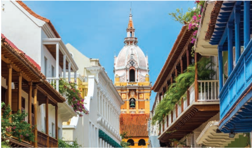
Old Town, Cartagena, Colombia