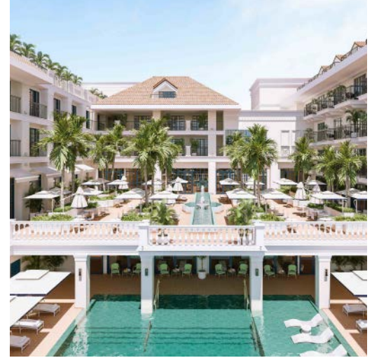
Sofitel Casco Viejo