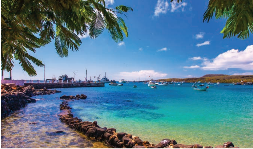
San Cristobal Island, Galapagos Islands, Ecuador