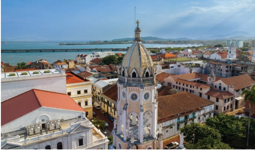
Casco Viejo, Panama City